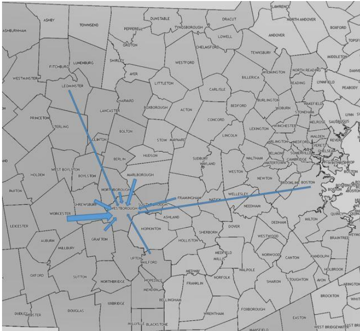
Where Westborough's Residents Work