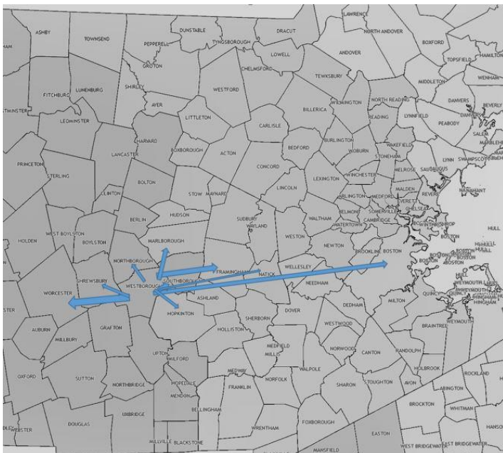
Where Westborough's Workers Live