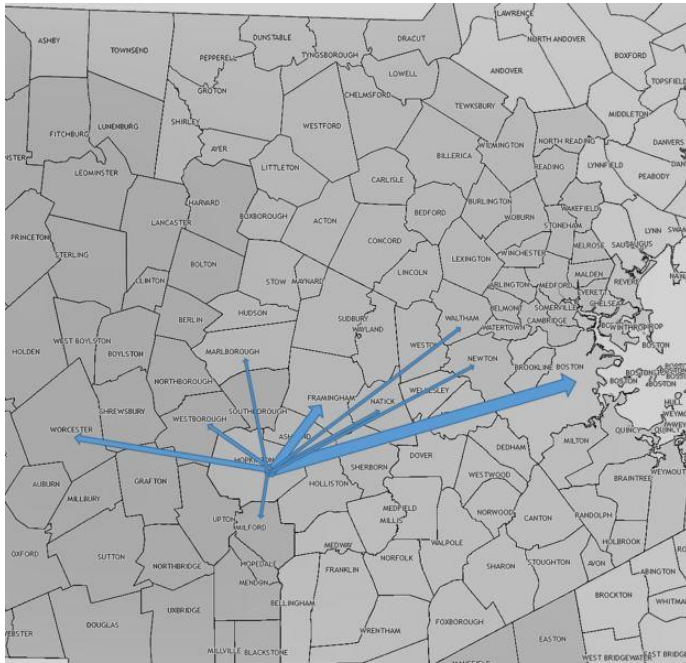
Where Hopkinton's Residents Work