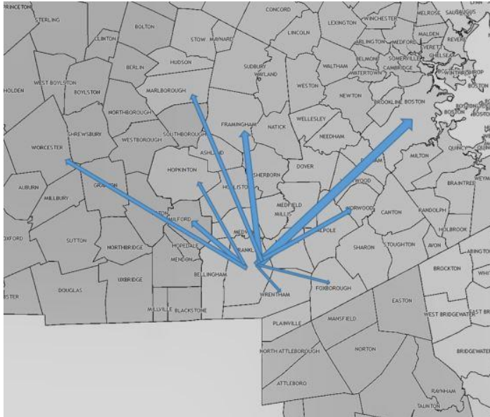
Where Franklin's Residents Work